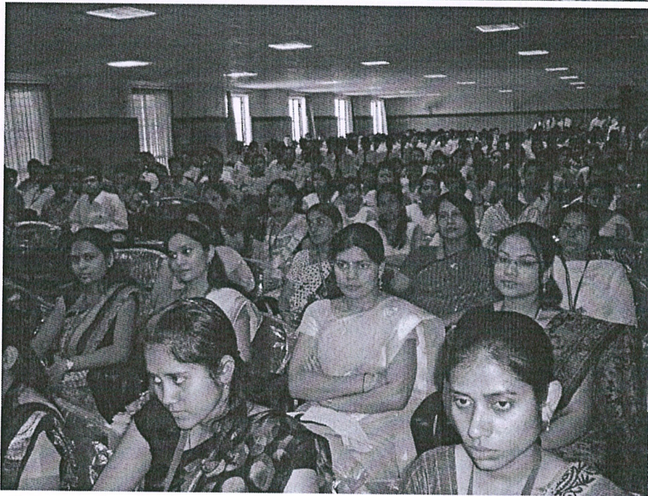
Chief Guest and Other WGC Members